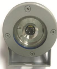
LED Exit Light