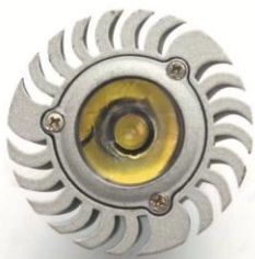
MR16 LED Bulb