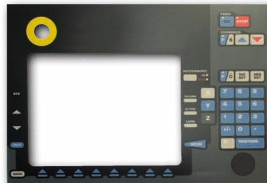
With Surface Mount LEDs